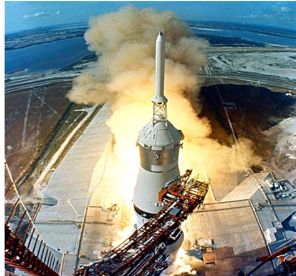
Launch of Apollo 11

Collection of thousands of images. Search by keyword e.g. Apollo 11.