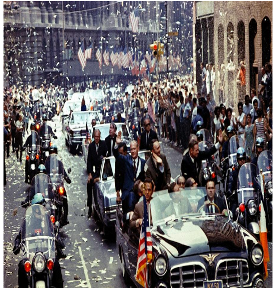
Apollo 11 crew get a heroes welcome

This feature is part of the CNN Cold War Experience series.