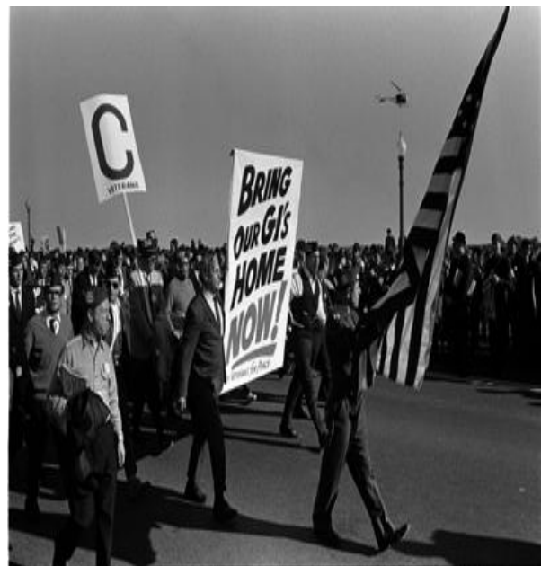
Anti - Vietnam War March

Detailed Glossary of the terminology and slang used by US soldiers during the War.