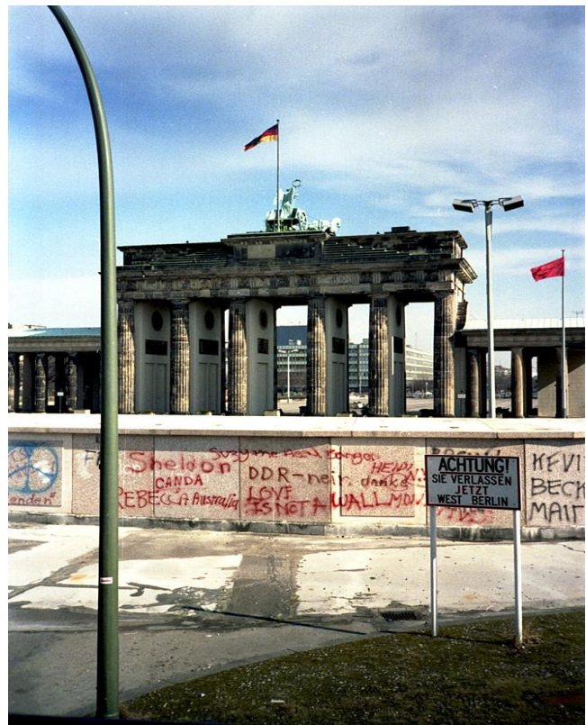
The Berlin Wall

This excellent site from the British National Archives helps students understand the Cold War with the use of primary sources.