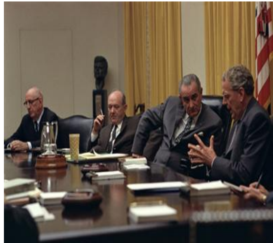
LBJ with his advisors in the White House

This site is also from PBS. It is more military focused with a brief history of the war. The site looks at the air war, guerrilla tactics and examines one siege during the war.