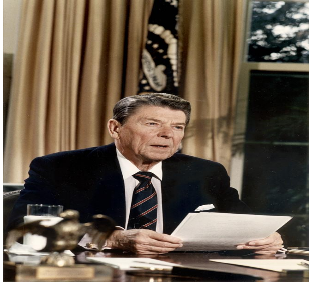
Reagan gives address to the Nation after the Challenger Disaster, 1986.

NARA administered site dedicated to the Great Communicator.