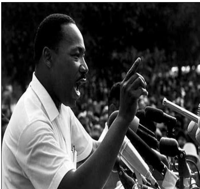
Martin Luther King gives a speech,

Excellent site with biography, timeline, speeches and photographs from the Seattle Times Newspaper .